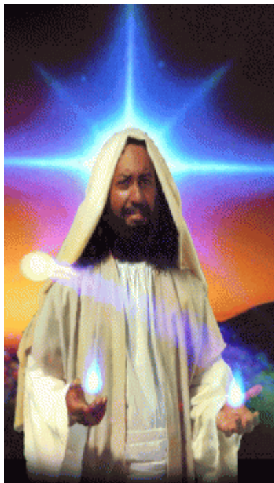
Al Masih Isa Ibn Allah "The Messiah Jesus Son Of God"

So, to set the record straight, we have done a little research. We have gone through the books that I have written throughout the many years, and have listed my Findings on Jesus the Christ.